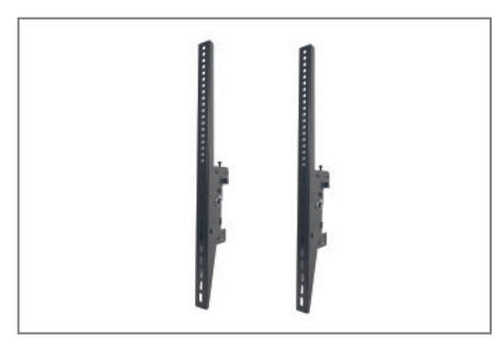
VESA max. 800 x 600 mm