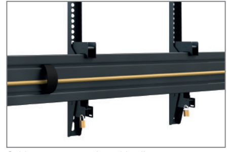
Cable management by cable clips