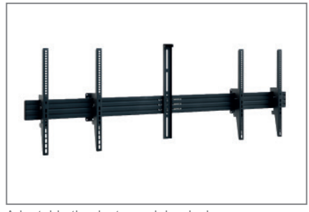
Adaptable thanks to modular design